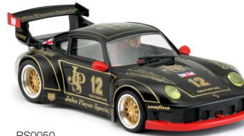
RS0050 Porsche 911 GT2 #12