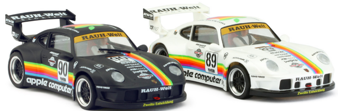
RS0049 Porsche 911 GT2 #90