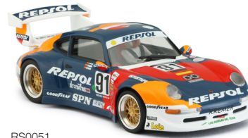
RS0051 Porsche 911 GT2 #91 RS0007B White Kit