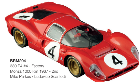
BRM204 330 P4 #4 - Factory Monza 1000 Km 1967 - 2nd Mike Parkes / Ludovico Scarfiotti