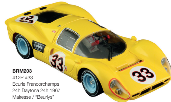
BRM203 412P #33 Ecurie Francorchamps 24h Daytona 24h 1967 Mairesse / "Beurlys"