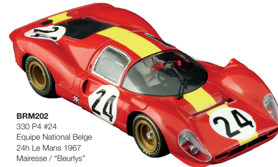
BRM202 330 P4 #24 Equipe National Belge 24h Le Mans 1967 Mairesse / "Beurlys"