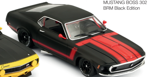
BRM-S01 MUSTANG BOSS 302 / CAMARO Z28 - Black edition Special twin pack limited edition