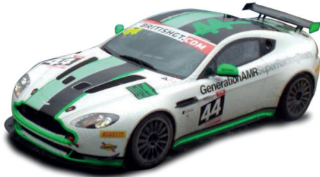
ASV GT3 Donington 2016 #44