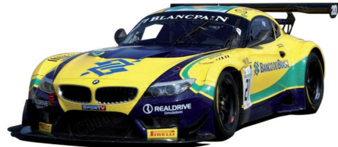
BMW Z4 Nogaro 2014 #21