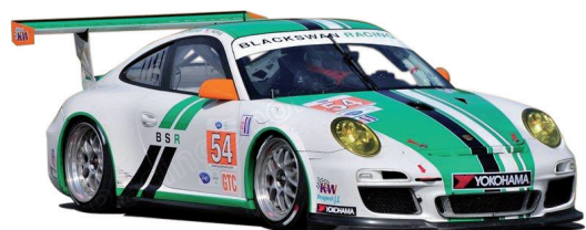
Porsche 997 Grand Prix Mosport 2011 #54