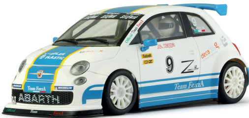
Abarth 500 Assetto Corsa Trofeo Selenia Mugello 2015 #9