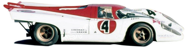
Porsche 917K Kyalami 1971 #4