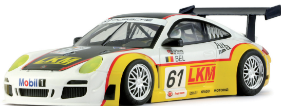
Porsche 997 Silverstone 2009 #61