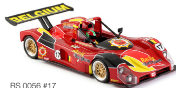
RS 0056 #17 24h Le Mans 1996 Body type C - Chassis Type A