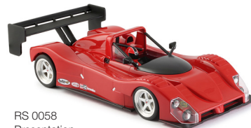
RS 0058 Presentation Body type A - Chassis Type A