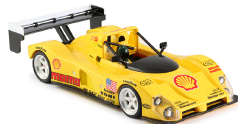
RS 0057 Challenge World Finals - Daytona 2016 Body type C - Chassis Type A