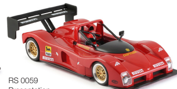
RS 0059 Presentation Body type D - Chassis Type B

WHITE KIT RS 0041A type A (long body) RS 0041B type B (short body) RS 0041C type C (long body - side air intake) RS 0041D type D (short body - side air intake)