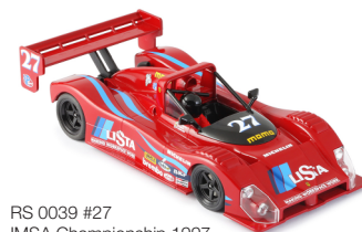
RS 0039 #27 IMSA Championship 1997