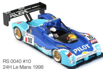
RS 0040 #10 24H Le Mans 1998