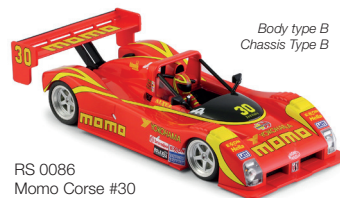
Body type B Chassis Type B

RS 0086 Momo Corse #30 2nd place 24H Daytona 1996 G.Moretti - B.Wollek - D.Theys - M.Papis