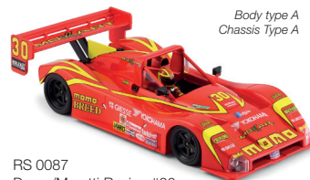
Body type A Chassis Type A

RS 0086 Momo Corse #30 2nd place 24H Daytona 1996 G.Moretti - B.Wollek - D.Theys - M.Papis