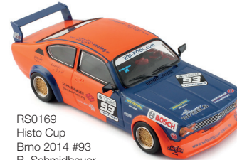
RS0169 Histo Cup Brno 2014 #93 B. Schmidbauer