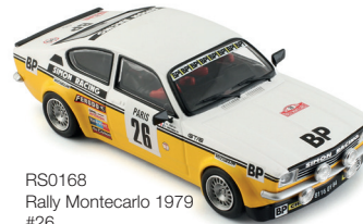
RS0168 Rally Montecarlo 1979 #26