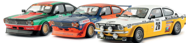
WHITE KIT RS0171A / RS0171B / RS0171C White Kit A/B/C