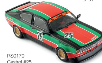
RS0170 Castrol #25 Zolder 1980