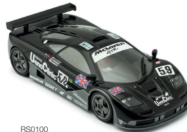
RS0100 Ueno Clinic #59 24h Le Mans 1995 Winner