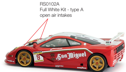
RS0102A Full White Kit - type A open air intakes