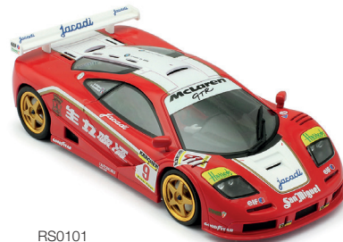
RS0101 San Miguel #9 3h Zhuhai 1995