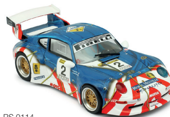
RS 0114 FFSA Championship 1998 Hello Racing Team - #2