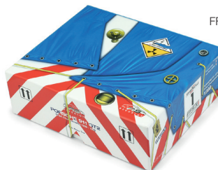
RS 0116 Porsche 911 GT2 twin pack FFSA Championship 1998 - 1999 Hello Racing Team - #2 - #1