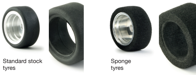
Standard stock tyres