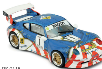
RS 0115 FFSA Championship 1999 Hello Racing Team - #1