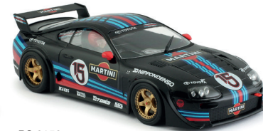
RS 0150 Toyota Supra Martini #15