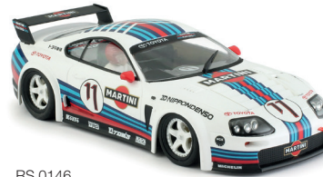
RS 0146 Toyota Supra Martini #11