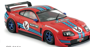
RS 0151 Toyota Supra Martini #16