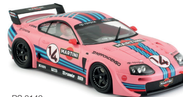
RS 0149 Toyota Supra Martini #14