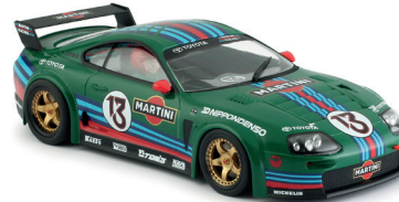
RS 0148 Toyota Supra Martini #13