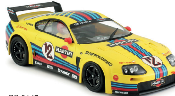
RS 0147 Toyota Supra Martini #12