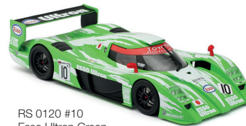
RS 0120 #10 Esso Ultron Green