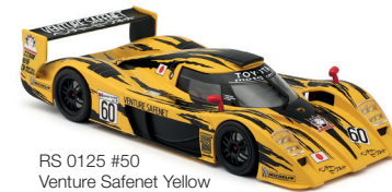
RS 0125 #50 Venture Safenet Yellow