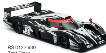
RS 0122 #30 Zent Black