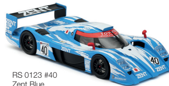
RS 0123 #40 Zent Blue