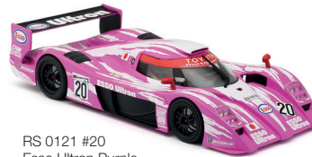
RS 0121 #20 Esso Ultron Purple