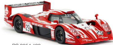
RS 0054 #29 24h Le Mans 1998