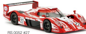
RS 0052 #27 24h Le Mans 1998