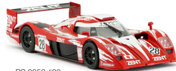
RS 0053 #28 24h Le Mans 1998