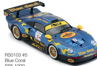
RS0103 #5 Blue Coral SPA 1999 British GT Championship