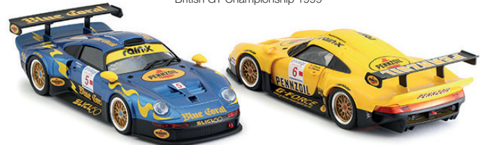
RS 0105 - Twin pack British GT Championship 1999